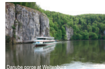
Danube gorge at Weltenburg

In July 2006 the Old Town of Regensburg and Stadthof were declared a UNESCO World Heritage Site. Till today you can see almost 2,000 years of historical development on the facades of the Old Town.